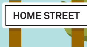
A street sign