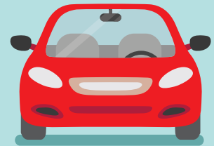
A red car