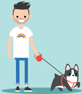
A dog on a walk