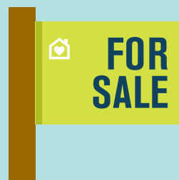
A 'for sale' sign